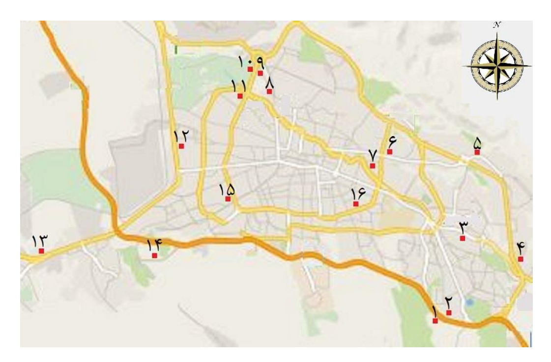
Fig. 1. Tabriz city map and location of gas stations

In order to evaluate the concentration, measurements were made in several different locations at the sites. These measurements were carried out at two levels next to the gas nozzles (center station) and within 5 m of the gas nozzles. The total VOC concentration was measured during the period using a portable measuring device, ION Science. The device is capable of accurately reporting 1 ppb to a total concentration of 20,000ppm.